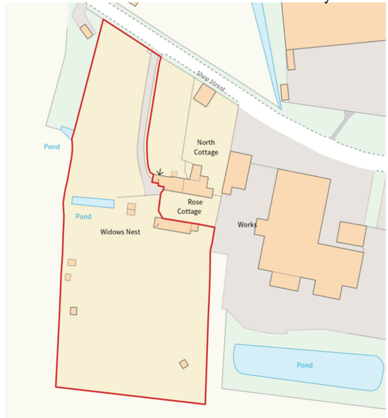
Site Plan - Indicative Only

The majority of the gardens and grounds are to the rear and facing almost due south these enjoy the sun throughout the day. The garden is predominantly laid to grass for ease of maintenance, but interspersed with a variety of established and maturing specimen trees and shrubs. The rear garden is almost entirely enclosed with post and stock proof fencing, together with established hedging in part, creating a very private area indeed. In the south-eastern corner of the garden there is also a patio area with summerhouse . Other buildings include a useful timber frame garden storage shed and a greenhouse , together with a range of more dilapidated garden sheds. In all, the gardens and grounds extend to approximately 1.75 acres (0.72 hectares).