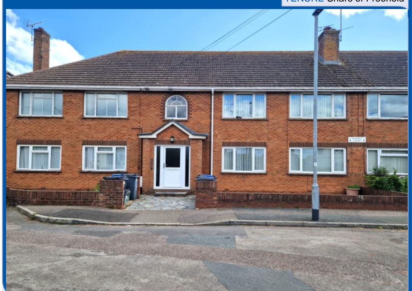
A Beautifully Presented Ground Floor Flat Enjoying A Convenient Cul-De-Sac Location With Its Own Front And Rear Gardens Offered For Sale With No Onward Chain

Upvc Double Glazed Windows * Gas Central Heating From Modern Boiler Attractive Lounge/Dining Room * Modern Kitchen/Breakfast Room * Two Double Bedrooms * Modern Bathroom Suite * Own Enclosed Rear Garden Viewing Recommended