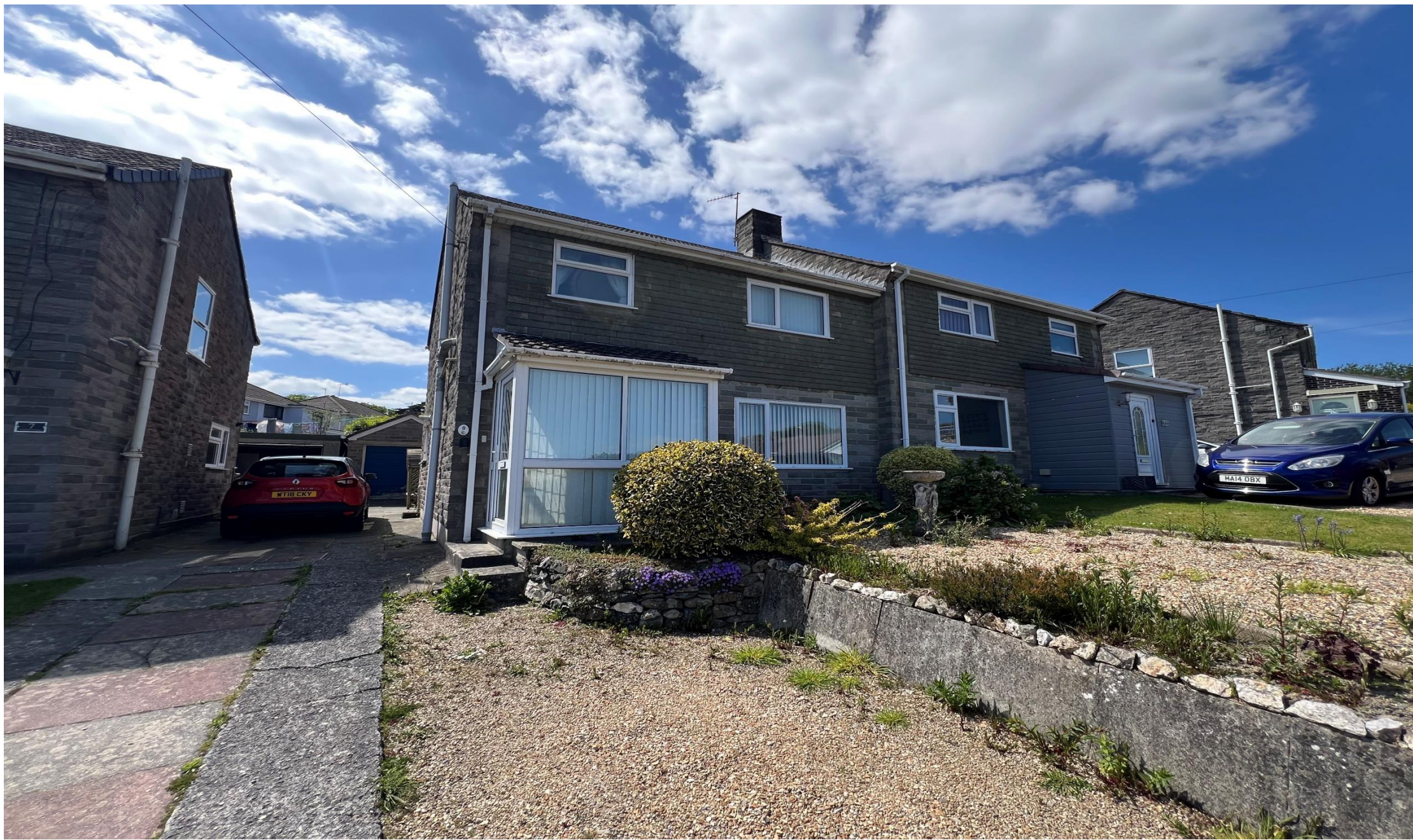
9 Clifton Avenue, Plympton, Plymouth, Devon, PL7 4BH