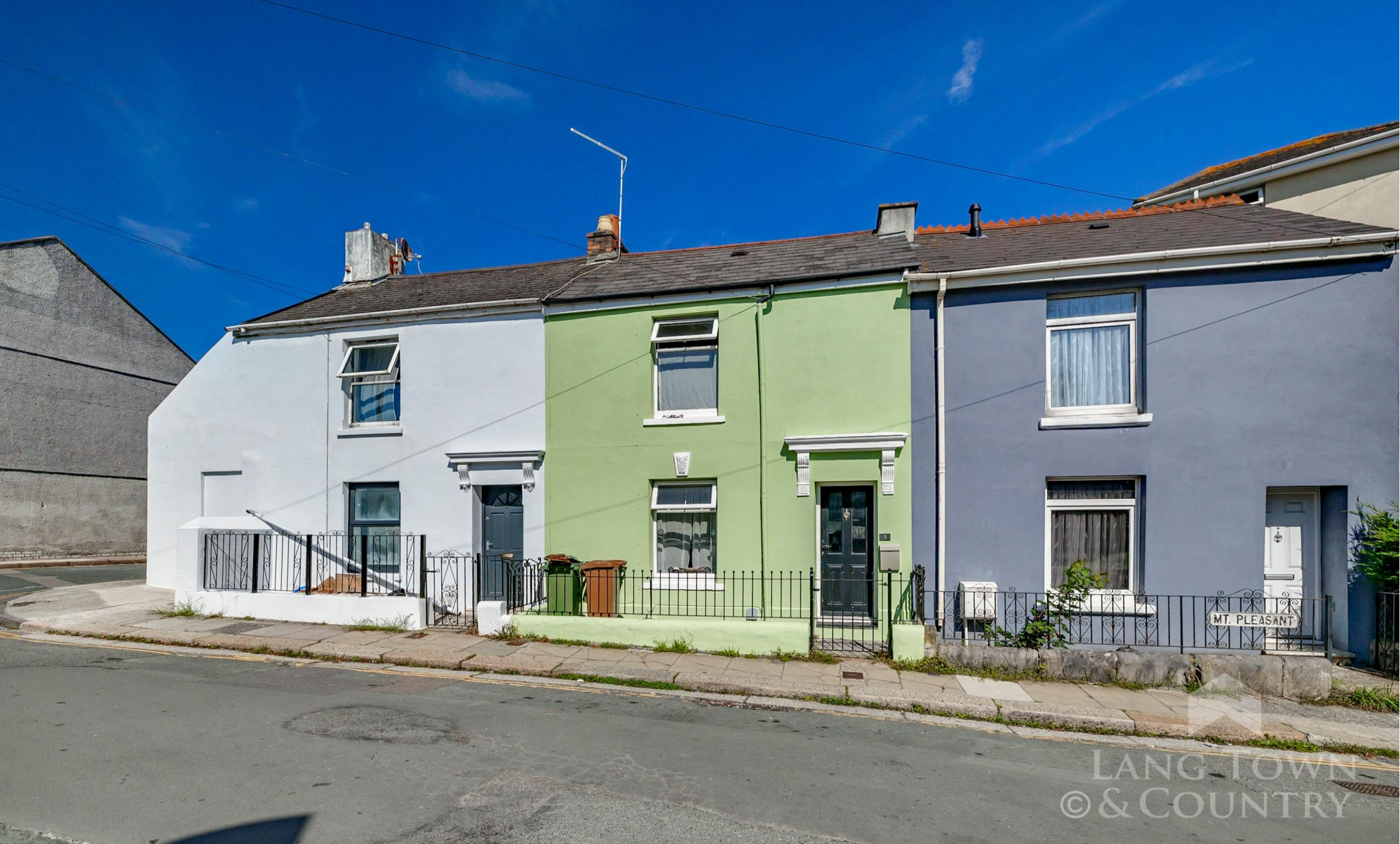
3 Mount Pleasant Terrace, Stoke, Plymouth, Devon, PL2 1EL