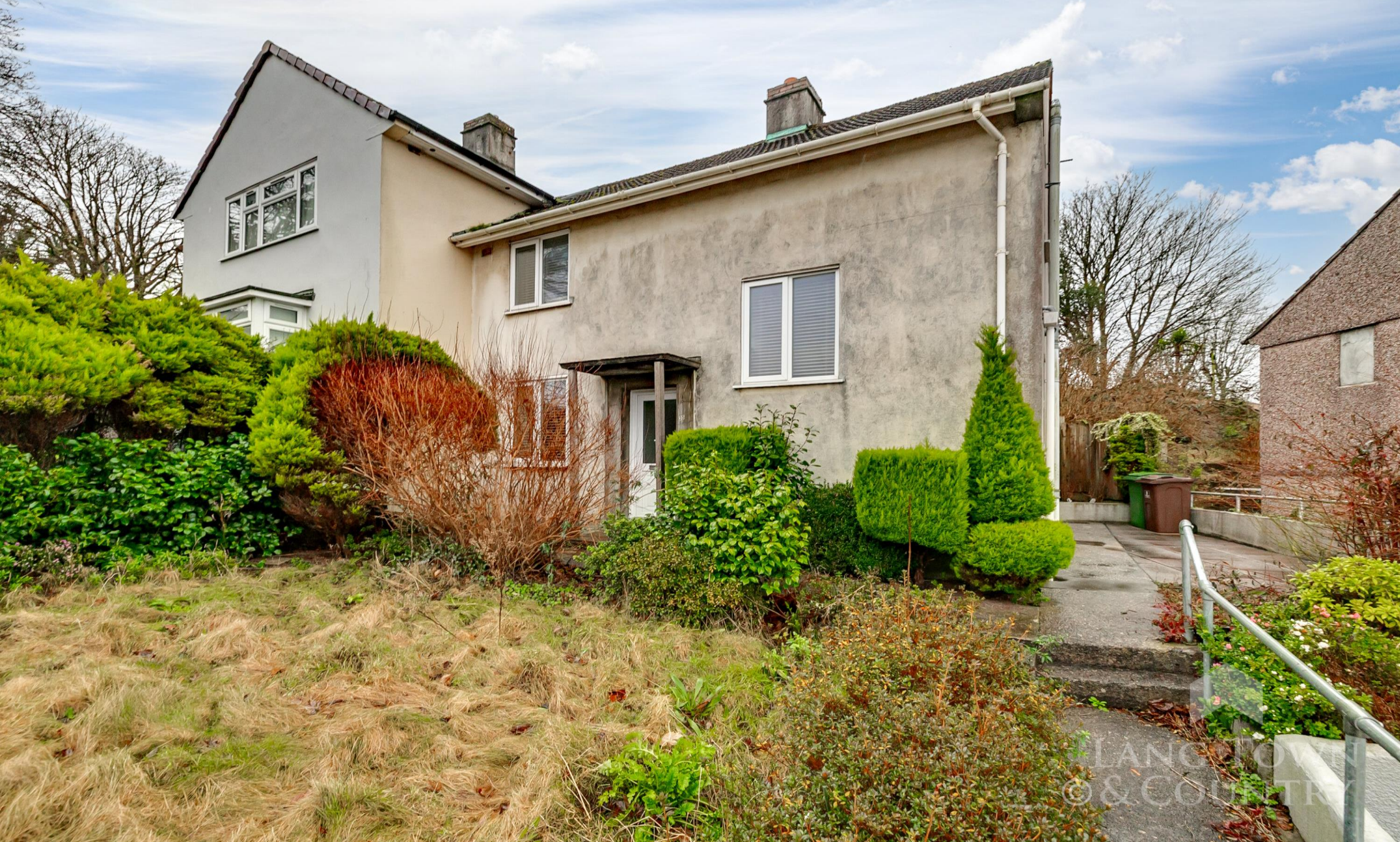
35 Melrose Avenue, Pennycross, Plymouth, Devon, PL2 3RQ