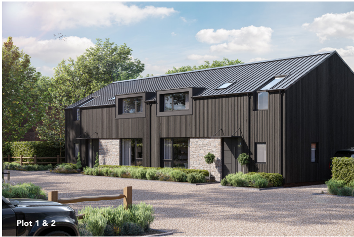
Plot 1 & 2