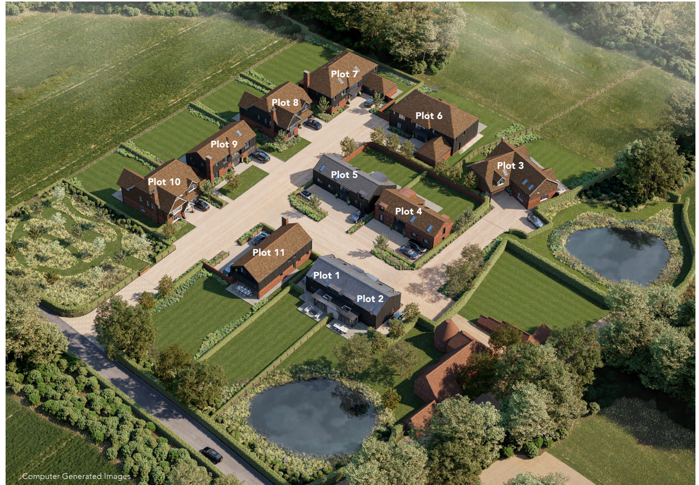
Computer Generated Images

An unprecedented opportunity providing 11x custom-build plots (3 already reserved) with far reaching views on an old farm setting. Within the borough of Sevenoaks, these 11 generous plots allow purchasers the once in a lifetime opportunity to build their own home in accordance with Design Guide created by Novo.