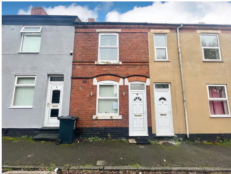
Shedden Street, Dudley, DY2 8NJ.