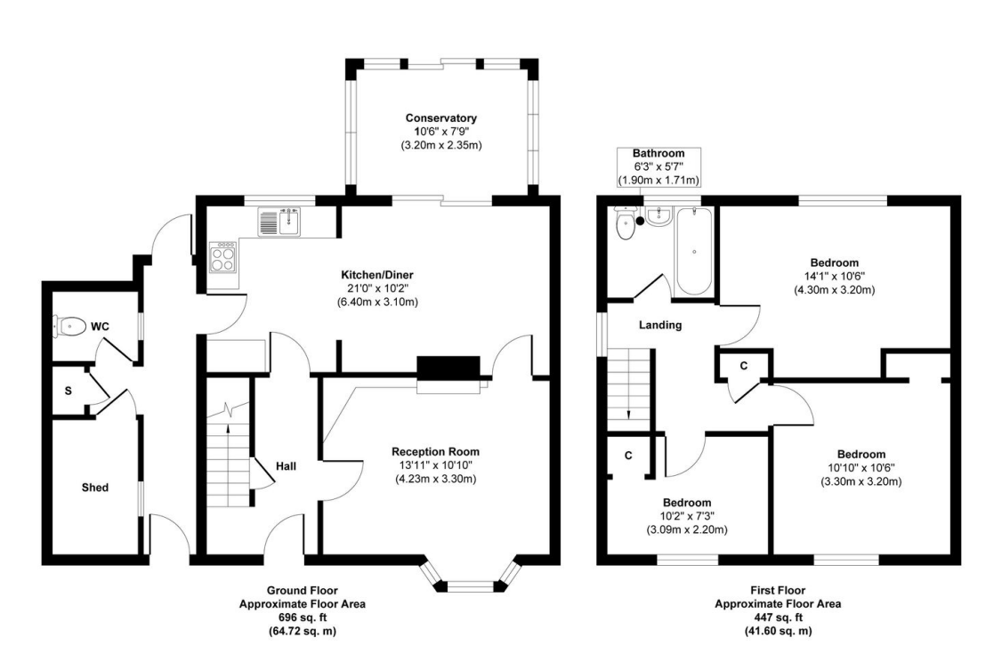
Approx. Gross Internal Floor Area 1143 sq. ft / 106.32 sq. m