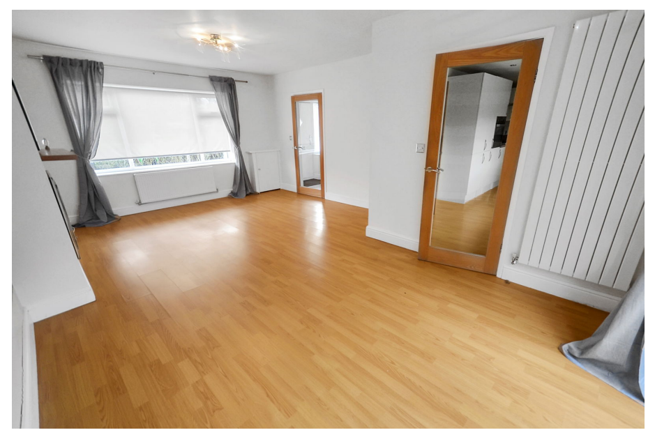
Tax Band: B Furnished: Unfurnished

Adams Estate Agent and pleased to Market this Stunning three bedroom Semi Detached property Located within a 10 minute walk of Stockton Heath's local shops, bars and restaurants with many amenities including good schooling.