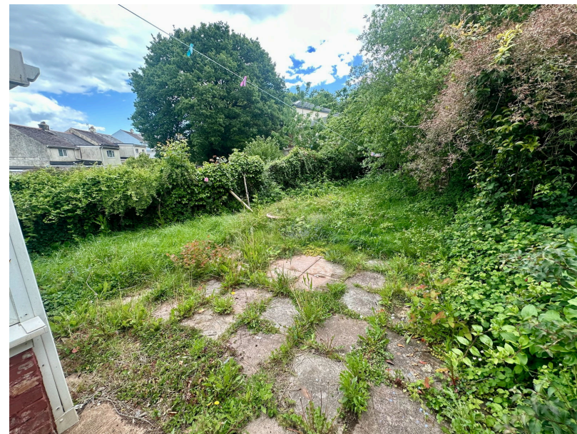
86 Longstone Road

RENOVATION OPPORTUNITY – Two Bedroom Semi-Detached Bungalow with Generous Gardens & No Onward Chain. Situated in a convenient and level location, this semi-detached bungalow offers excellent potential for buyers looking to modernise and create a home to their own taste. Ideally positioned close to local shops, schools and everyday amenities, the property is offered for sale with no onward chain. In need of full renovation throughout, the accommodation currently comprises two bedrooms, a lounge, kitchen, conservatory and entrance porch. Outside, the bungalow benefits from good-sized gardens surrounding the property, offering plenty of outdoor space and further potential. This is an ideal opportunity for investors, buyers seeking a project in a well-connected residential location.