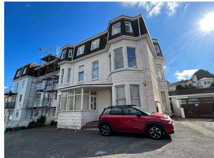
F/F/F - 3 Casa Marina

Well proportioned South Facing first floor apartment situated in popular Roundham. It has a spacious Living Room good sized Bedroom, modern Kitchen, Hallway and a Shower room. Benefits include Electric Heating and UPVC Double Glazing. Outside there is a well maintained communal Garden Area and a Drying Area. Its has an Allocated Parking Space to the front of the building. Benefits include a new 999 year lease being put in place, you will own a share of the freehold and you will pay no ground rent. The Amenities of the Harbourside, Sea Front and Town Centre are all to hand. Currently CHAIN-FREE call us to view.