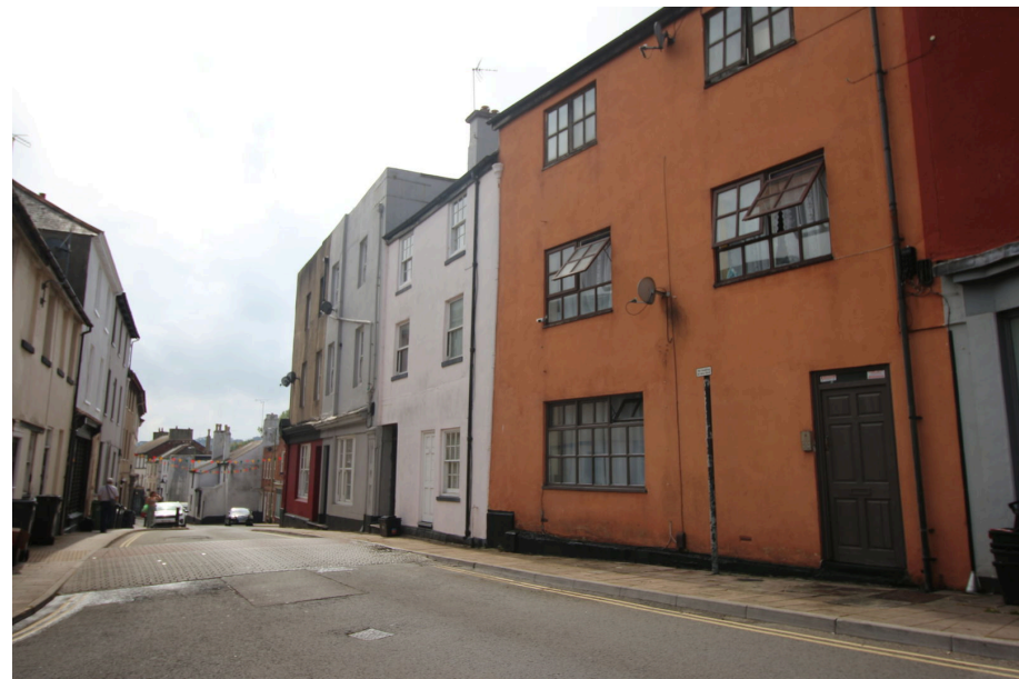
Flt 1, 157 Winner Street Paignton

A Well Presented Ground Floor Flat situated right in the heart of Paignton Town Centre. Ideal FTB or for Investment. Accommodation comprises Lounge , Fitted Kitchen, Bedroom, Hallway and Shower Room. Gas Central Heating and Double Glazing. Outside to the first floor there is a communal Patio Area. Great location for access to all of the Shops and Amenities of Paignton Town Centre.