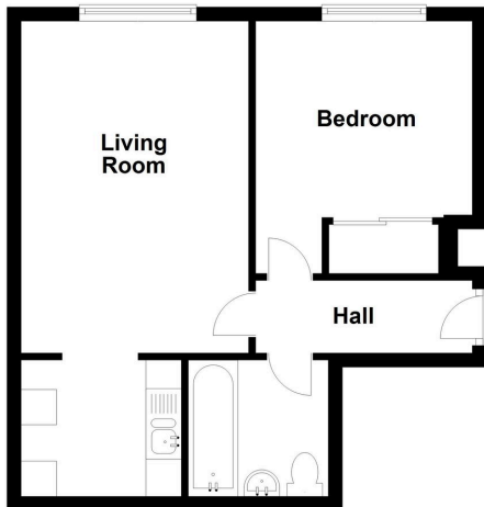
This plan is to be used only as an indication of the floor layout and is not to scale. Plan produced using PlanUp.