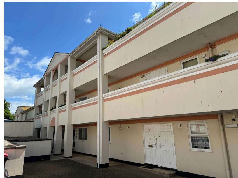
3 DAWES COURT

Accommodation briefly comprises; Entrance, Hallway, Good sized Living Room, Kitchen, Double Bedroom with fitted wardrobe and Bathroom. Double glazing and electric heating. Outside there is communal parking, residents lounge, laundry room and well kept communal gardens. The Town Centre, Shops, Doctors and Bus Services all close by. Vacant Possession just call us to View !!