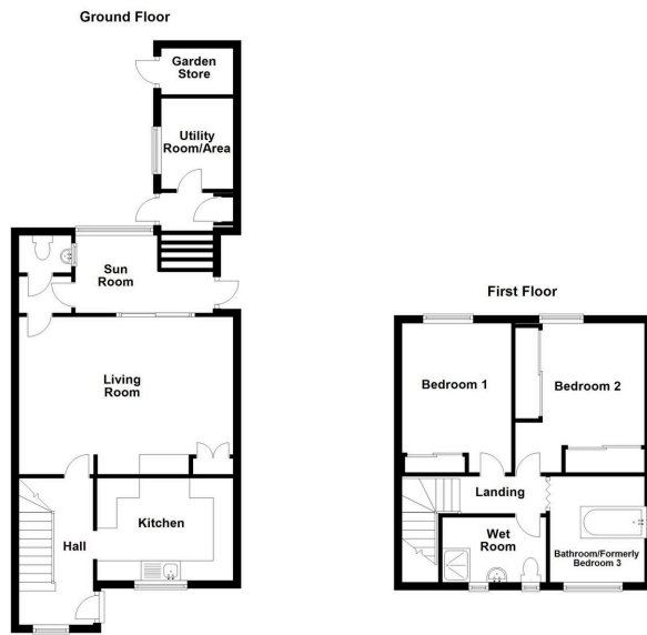
This plan is to be used only as an indication of the floor layout and is not to scale. Plan produced using PlanUp.