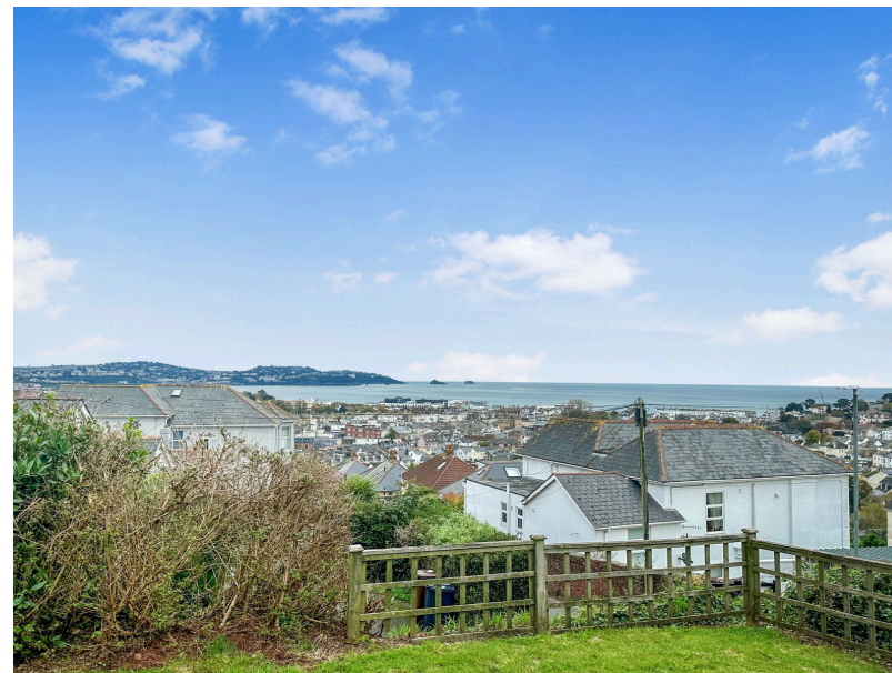
Apartment 1 Ocean Point

Set in a prominent location in Primley Park, Ocean Point is a high standard conversion of a former Gentleman's Residence in around 2010. This superb 2 double bed roomed garden apartment enjoys its own entrance, and has lovely sea views across its own private, south facing terrace and lawn, towards Brixham in the distance. Quality fitments throughout including a fully fitted kitchen and contemporary bathroom. Other benefits include double glazing, gas central heating and allocated parking. It has been thoughtfully designed to maximise impact of the extensive open views across Torbay. Ideal for professionals, retirees or even a holiday home. Pets allowed subject to conditions. It is only moments away from the Seafront, the Shops and all the amenities of the Town Centre. Offered for sale with no onwards chain.