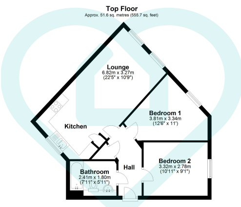
Total area: approx. 51.6 sq. metres (555.7 sq. feet)

This floor plan is for illustrative purposes only. All measurements and layouts are approximations and do not necessarily capture the precise specifications of the proporting. Mo responsibility is taken for any error, omission, or misstatement. We always recommend viewing in person to confirm the exact floor plan of a property. Made with Metropix.