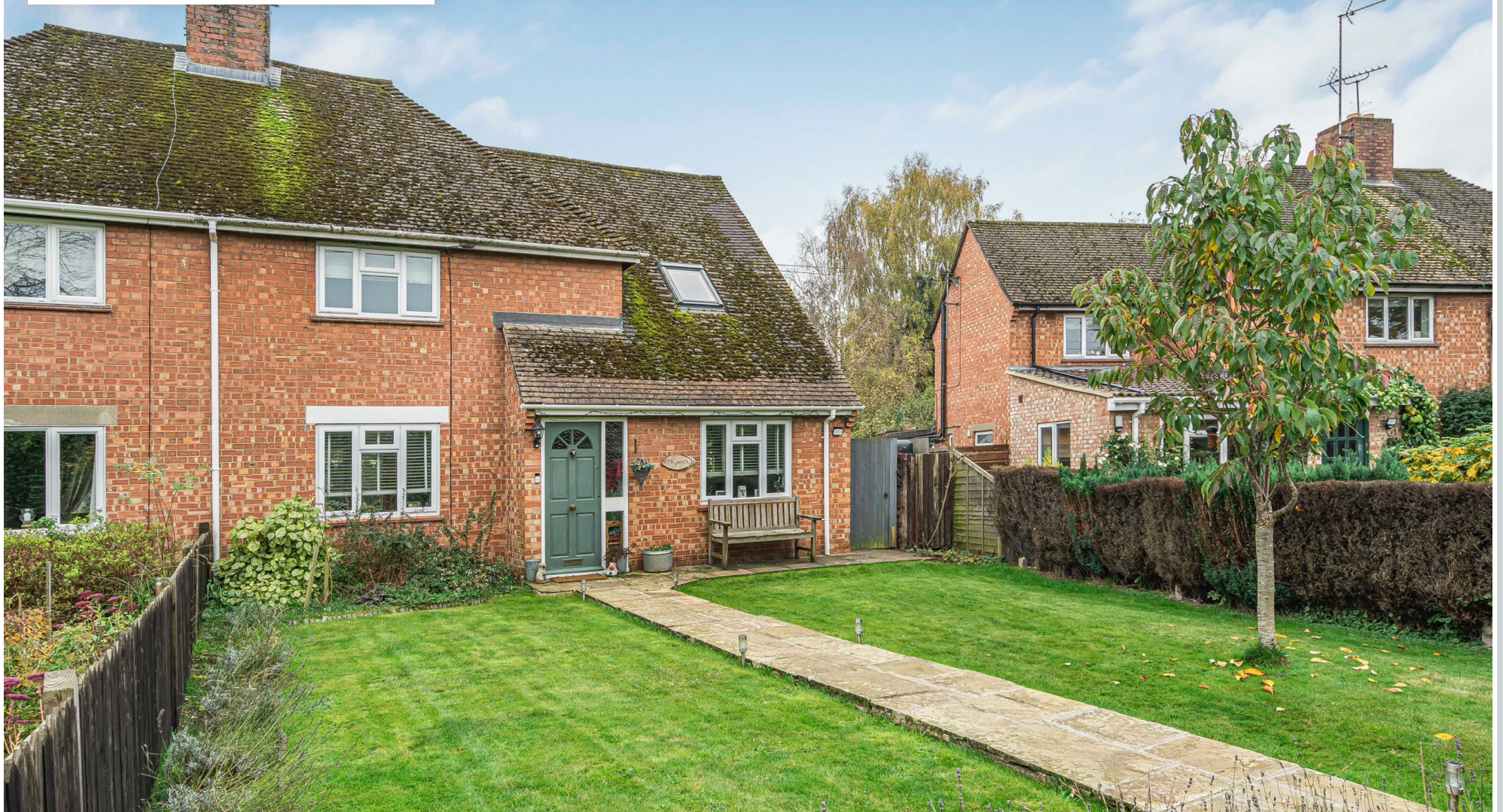
4 Weller Close, Berrick Salome, OX10 6JH