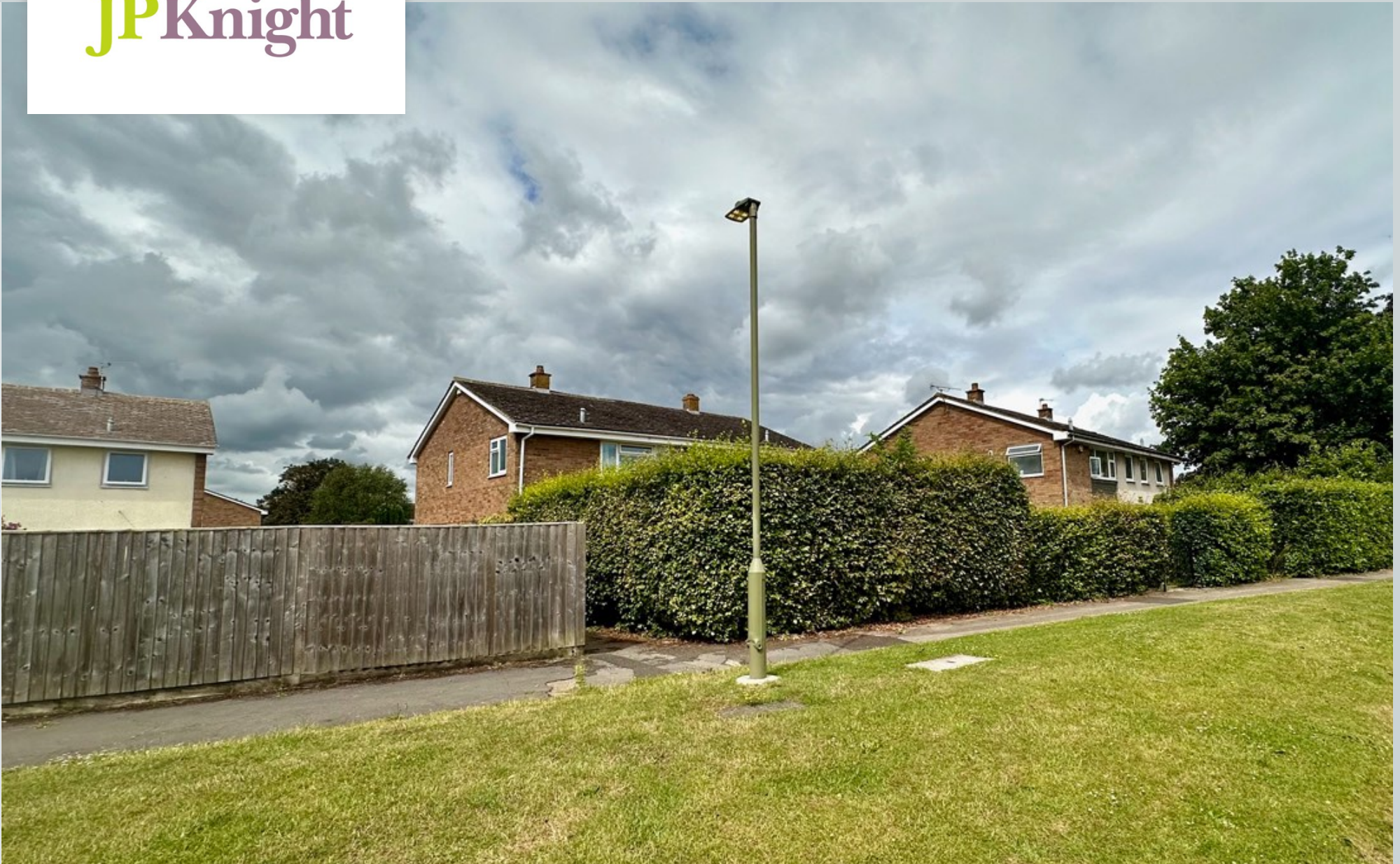
22 Windrush Road, Berinsfield OX10 7PF