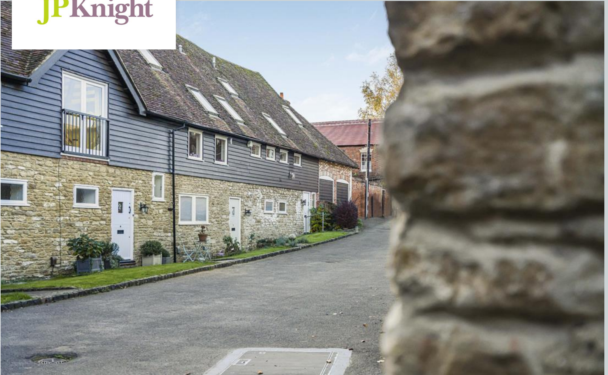
Fairlawn Wharf, Abingdon, OX14 5ED