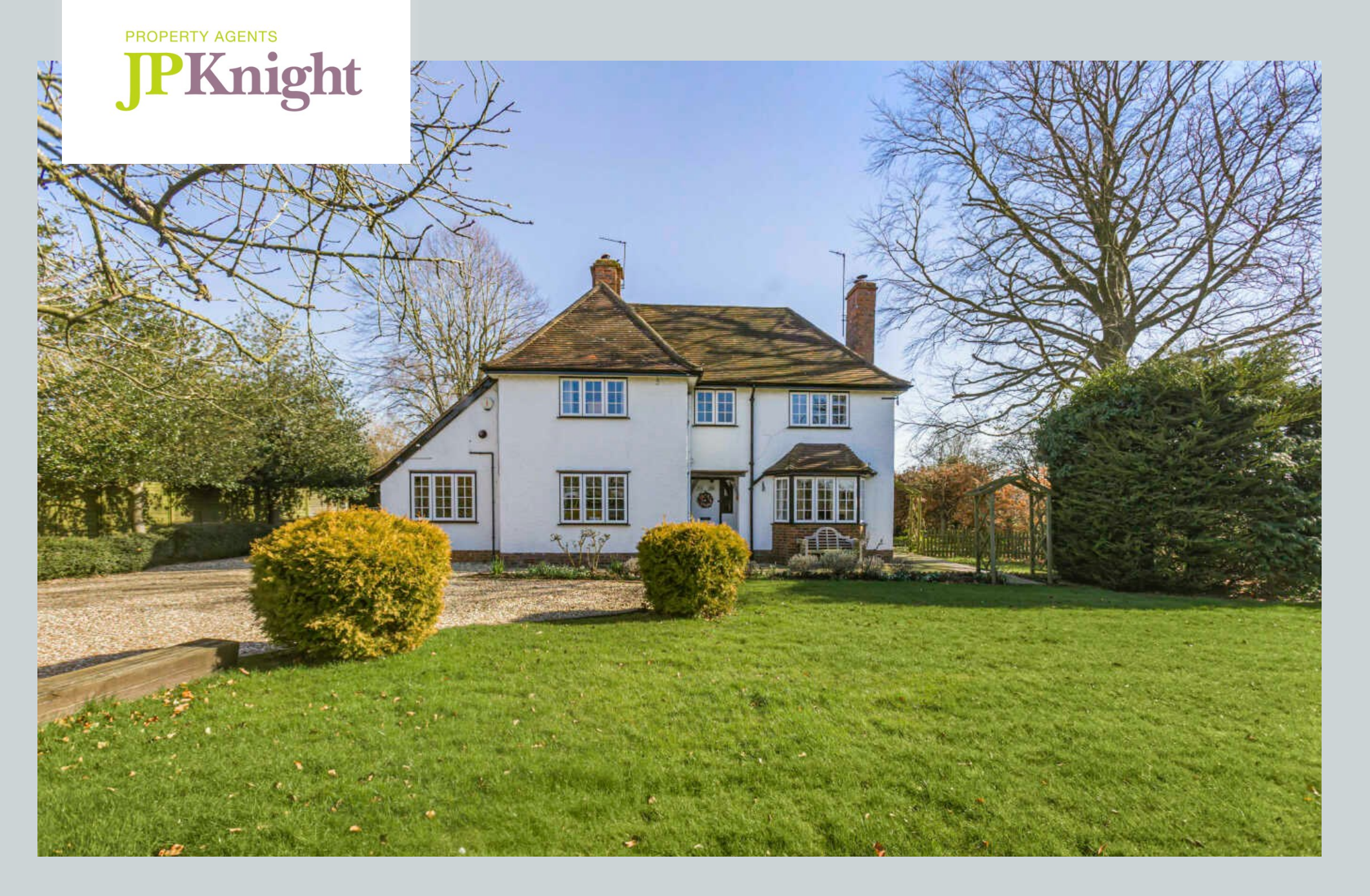
Wallingford Road, Shillingford OX10 7ES