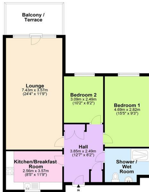
Floor Plan Approx. 74.4 sq. metres (801.3 sq. feet)

Total area: approx. 74.4 sq. metres (801.3 sq. feet)