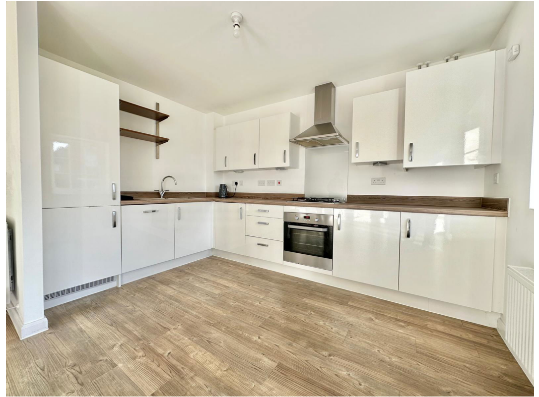
15 Cox Meadow Road, Leicester Forest East