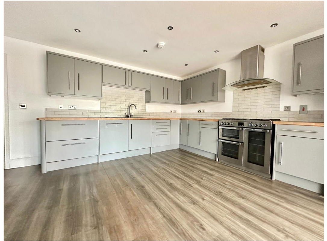
Holmfield Avenue West, Leicester Forest East