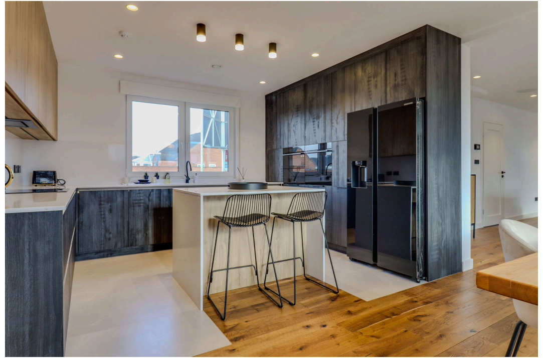
Plot 2, The Laurels, Main Street,