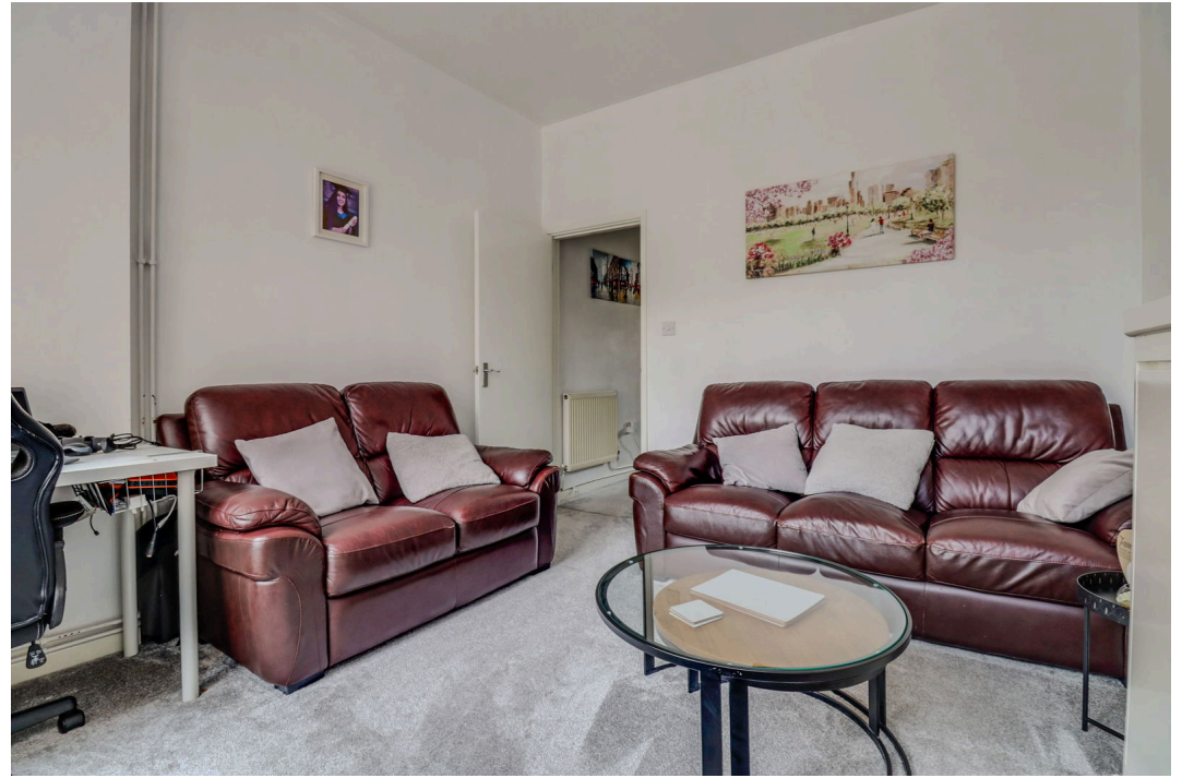
Melton Road, Belgrave