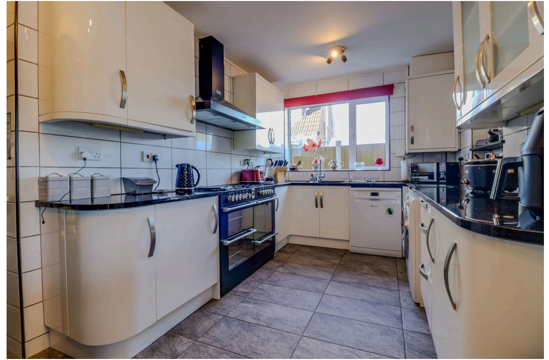
Jacqueline Road, Markfield