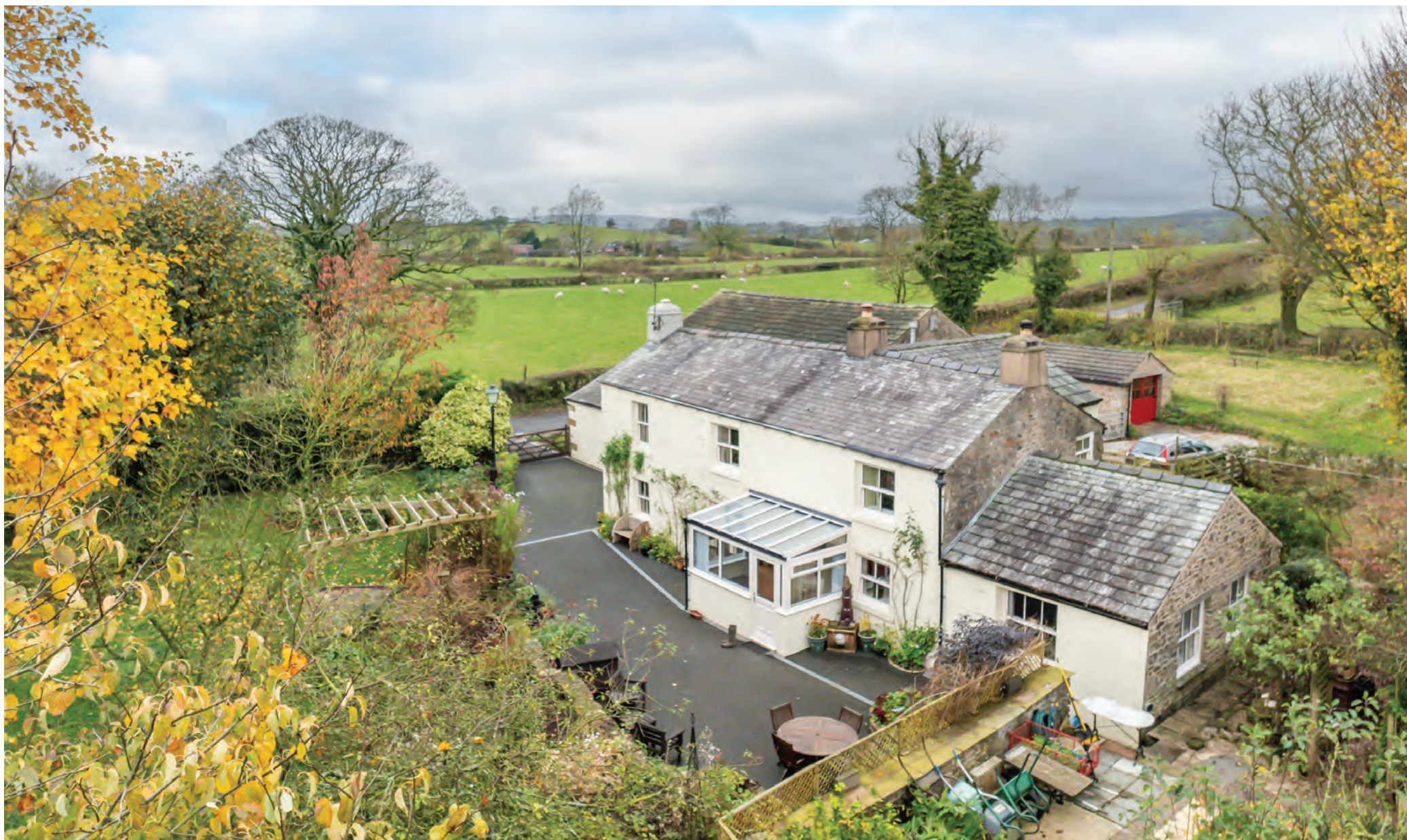
Langber End Farm Ingletton | North Yorkshire | LA6 3DT